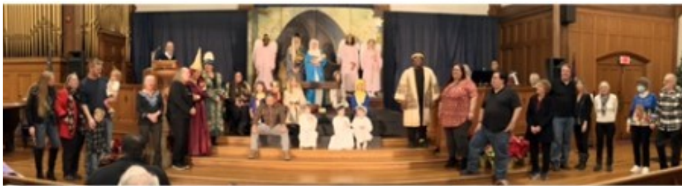
Some of the people in this picture have family that participated in the very first years of the Pageant over 90 years ago!