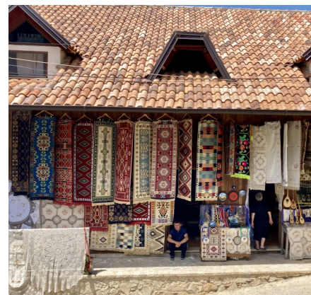
A shop in Kruja, Albania